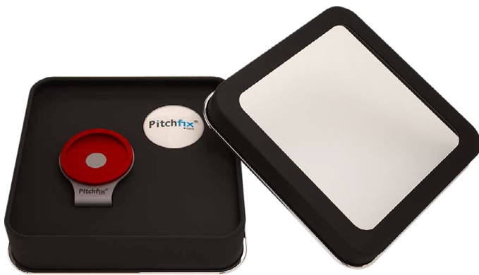
Tin window for Hatclip

Our Tin Window packaging features a clear window that allows the tool to be seen. Inside, the box has a black blister mould that holds the product in place.