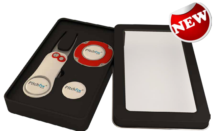
Tin window for Hybrid 2.0 and MultiMarker Chip