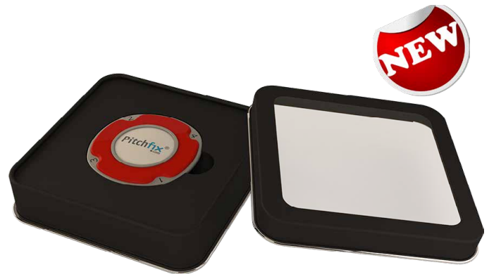
Tin window for MultiMarker Chip