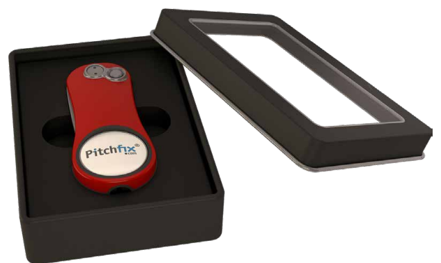
Tin Window for Hybrid 2.0, Fusion 2.5, Original 2.0 and XL 3.0