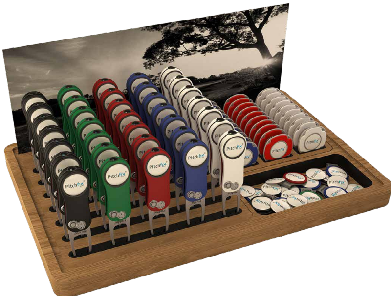
Birdie 2.0 display with added MultiMarker Chip module