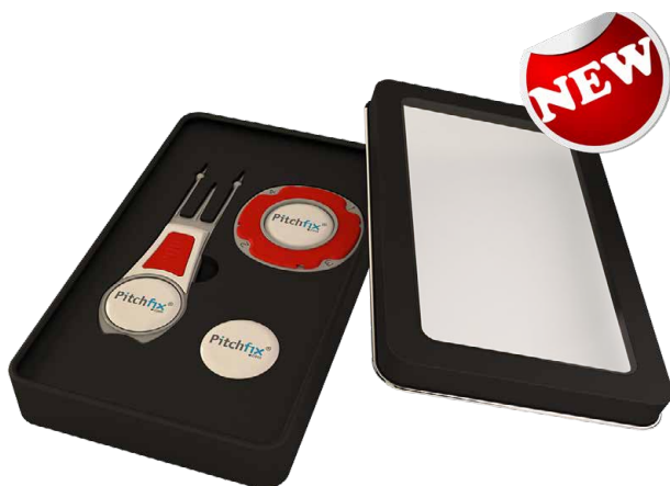
Tin window for Tour Edition 2.5 and MultiMarker Chip