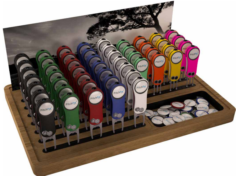
Birdie 2.0 display with added 16 tools module