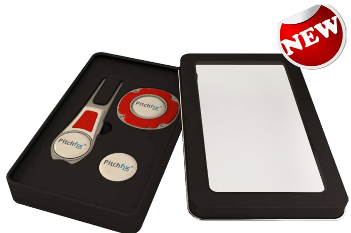
Tin window for Tour Edition and MultiMarker Chip