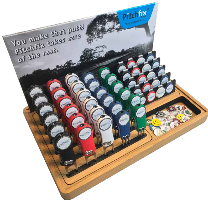
Birdie 2.0 (Fits all Tools)