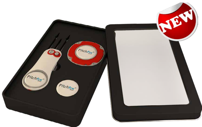
Tin window for Fusion 2.5 and MultiMarker Chip