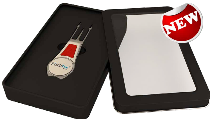
Tin window for Tour Edition 2.5