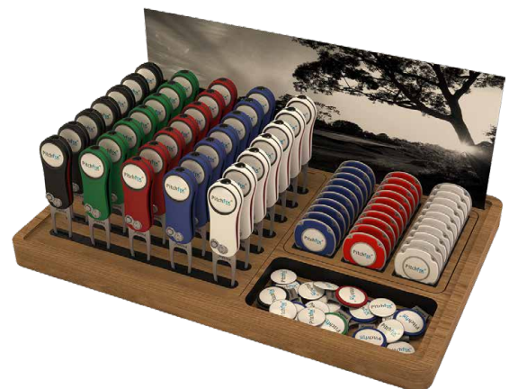
MultiMarker Chip Display

can replace hatclip module in Birdie 2.0 display