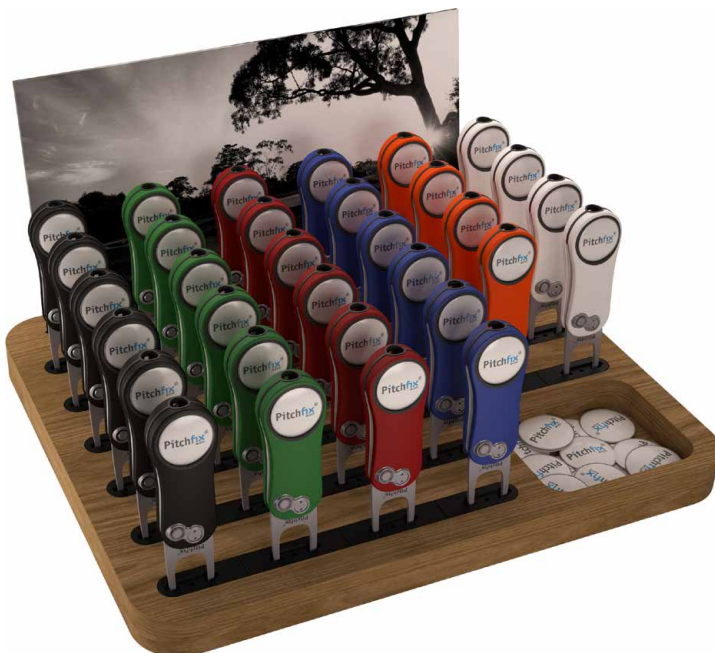
Par 2.0 (Fits all Tools)

can replace hatclip module in Birdie 2.0 display