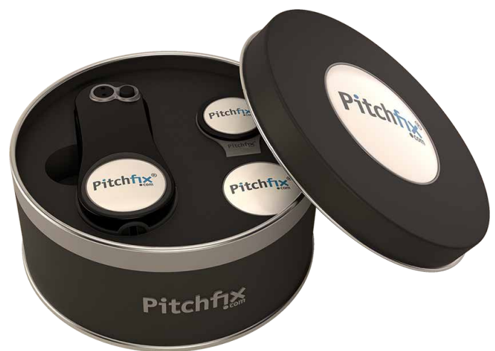
Round tin with extra Ball Marker and HatClip