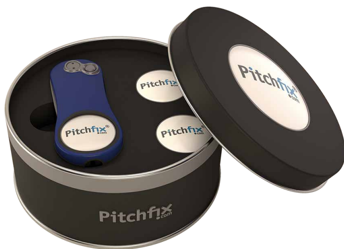
Round tin with 2 extra Ball Markers

Our round presentation packaging is produced from high quality metal alloy and available for all switchbalde products. You can choose between either a hat clip and spare ball marker, or two spare ball markers. The 50mm diameter domed area on the lid ensures your logo or brand stands out from the crowd!